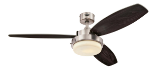
Reversible Wengue Finish Blades